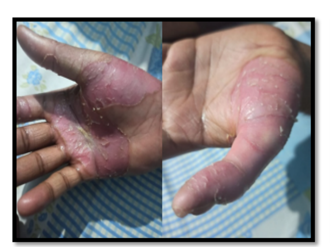
Figure 1 (before treatment)