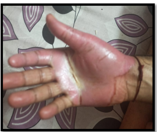
Figure 2 (during treatment)